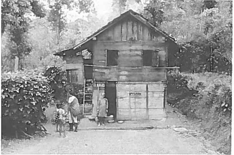
8. A house in the hills in Renah Kayu Embun