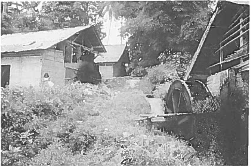
9. The water-mills of Pondok Tinggi