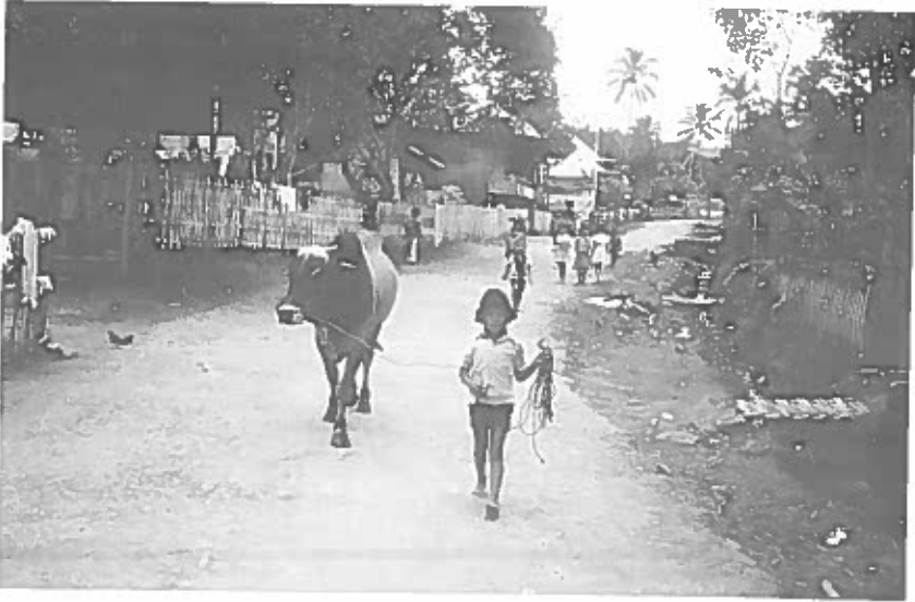
6. A street on the perimeter of the village centre