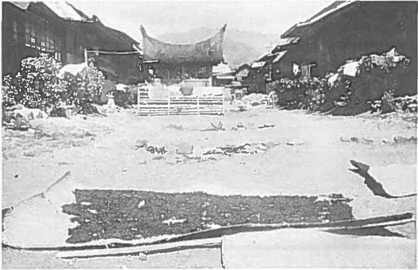
2. The founder's grave in lahei tengoh