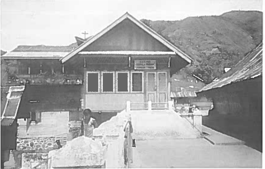
4. The village Head's office by the Mosque