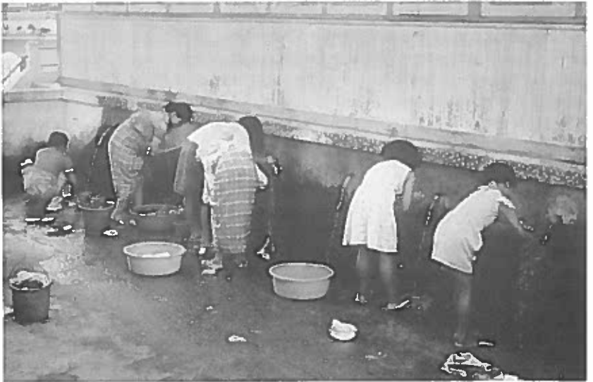
5. Women and girls doing the washing by Mosque's conduits