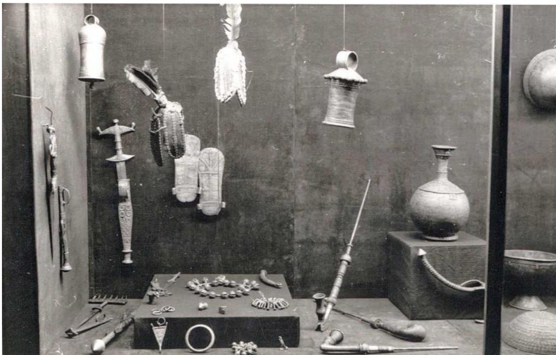
Photographs by Carolyn Bassing 1967

As well as an insight into a moment in the history of the Jos museum, these photographs provide a glimpse of some objects for which we otherwise lack visual reference. Jos accession numbers below are in bold. We omit the year, place and number for the series of objects Chappel collected in 1966: J66.11.NNN simply citing the object number NNN .