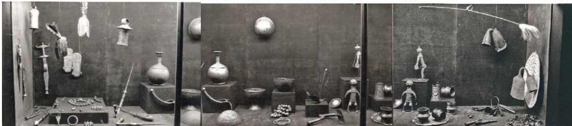
Display case in Jos (left, centre and right) 1967

Three photographs of a vitrine case installed at the Jos Museum the 1967 were sent to Tim Chappel. On the reverse, they are inscribed, 'Background: blue velvet. Above window, against the velvet, in red letters is Brass Work of Adamawa (in Hausa too). Labeling on transparent plastic under glass on the wooden frame outside the case. Frames slanting outwards.' In the event, as we see below, the display also included some iron works. It is suggested by the sender that the photographs be fitted together to appreciate the full installation, but this is made difficult by them having been taken from different angles. Below we have instead set them alongside one another.